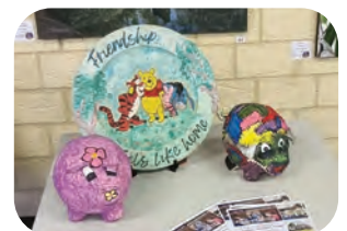
▲ Residents enjoyed this year's Woolorama show