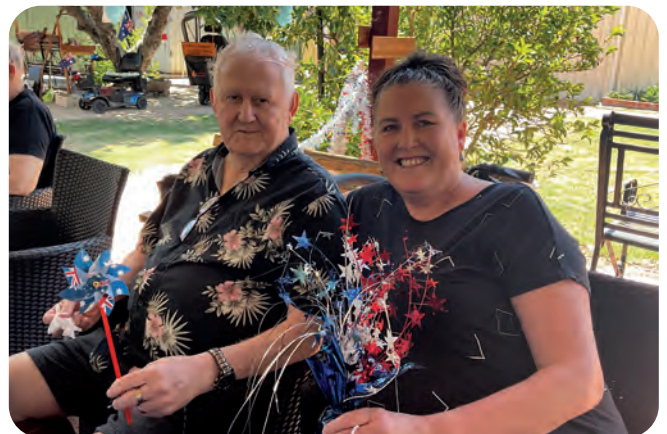
▲ Residents enjoyed a morning tea to celebrate Australia Day.