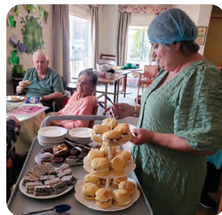
▲ Residents enjoyed fun activities on St Patrick's Day and had a cultural feast on Harmony Day.