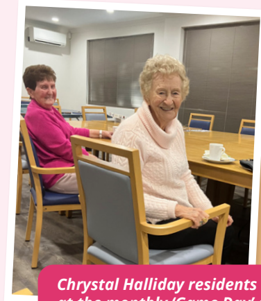
Chrystal Halliday residents have had a ball at the monthly 'Game Day' afternoon.

We had one in August and it was a lovely afternoon after the new year this will be ran monthly from Chrystal Halliday again all are welcome I will get back to you all with dates and keep you all up-to-date.