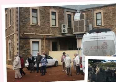
Rowethorpe residents have enjoyed many bus outings this year.

In 2023, we managed outings for 325 ILU Residents and 1664 Residential Aged Care residents. This is a great outcome essentially with only one bus.