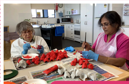
Painting egg shell cartons

The result was absolutely beautiful and we are so grateful to all those residents who were involved in creating this colourful display.