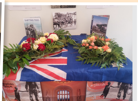
Poppy sheath decorations