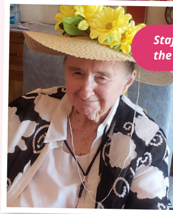
Staff and residents celebrate the Melbourne Cup.

Would it be the staff or residents who took out the cup this year?