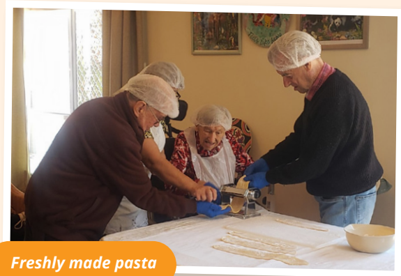
Freshly made pasta

You have really demonstrated Juniper's values of Welcome, Compassion and Respect to our residents!